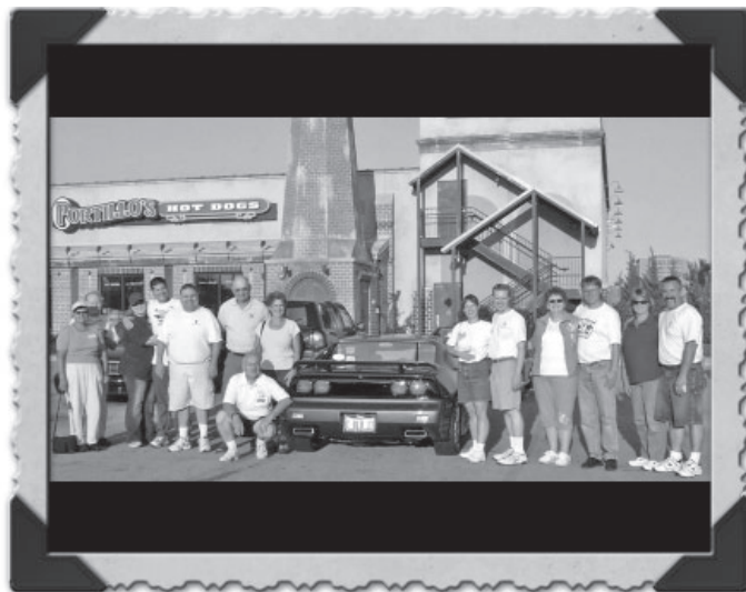
Image 7: Fierorama doesn't end at the close of the show on Sunday. Join us at Portillo's for a farewell dinner before you head home; Fierorama 2007 shown here.

Sunday, Fierorama show day is finally here! The curtain call for volunteers and all NIFE Board Members is 7:00am sharp. Cars begin arriving as early as 9:00am and the show officially opens at 12 noon. Peer judging takes place from 1:00pm to 2:30pm. The awards ceremony kicks off with the door prize and 50/50 drawings. In recent years, because of the generosity of our sponsors and several NIFE Members, there have been auction items. Once the auction closes, the awards ceremony begins! Special awards for highest and lowest VINs are given out as well as awards for the most miles driven to Fierorama in a Fiero. Plus, one (un)lucky participant will win the not so coveted,