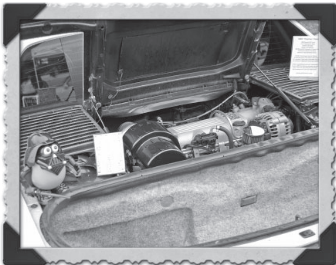
Just one example of the many different modified engines you will see at Fierorama in either the Non-V8, or V8 Engine Swap Classes.

This '80's themed Fierorama saw the expansion to include Friday night activities, but rain hampered our attendance