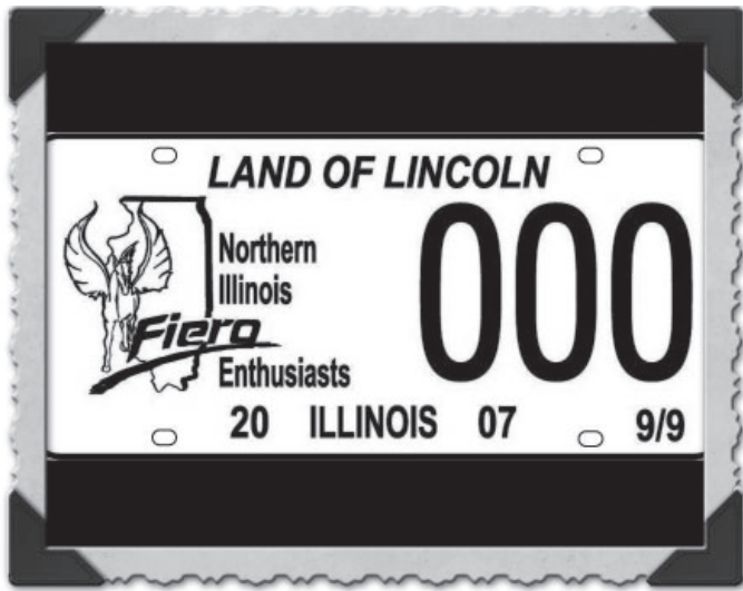
Image 3: The State of Illinois' Special Events License Plate Program.

building parking lot near the corner of 22 nd Street and Midwest Road. At the time, the Cruisin' Tigers GTO Club was using that same location for their annual "Indian Uprising" All Pontiac show. A McDonald's Restaurant located on the edge of the parking lot provided food and restroom accommodations.