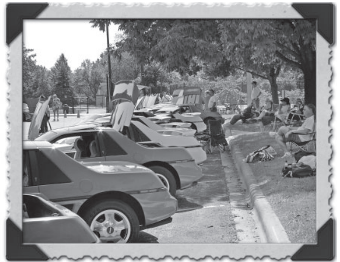
The Stock Notchback Class Coupe Class at Fierorama is broken down into two mileage brackets - 50K to 100K miles and over 100K miles.

Jersey Mike's of St. Charles, IL begins providing food for participants and guests. The NIFE "Enthusiasm Award" this year honored